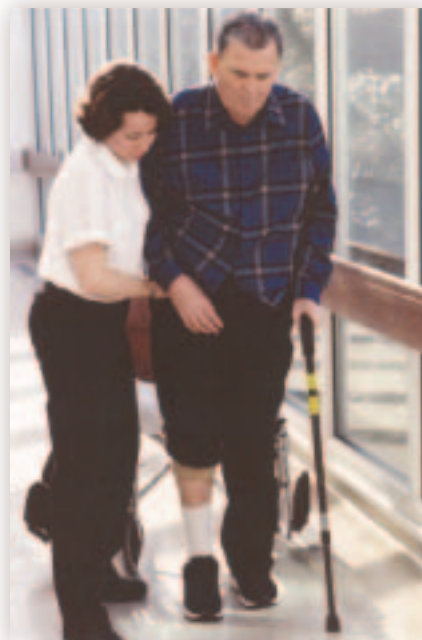
Outpatient rehabilitation programs offer benefits to patients following a stroke.

Outpatient programs for stroke survivors allow physicians to manage medication regimens and use other methods to prevent secondary