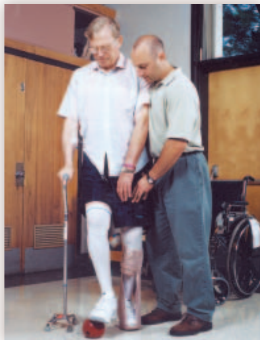
For an elderly person with an illness or injury that compromises independence, a program of inpatient rehabilitation often can make a dramatic difference.

In a specialized program, older patients also have the benefit of being with others their own age, particularly during recreational therapy